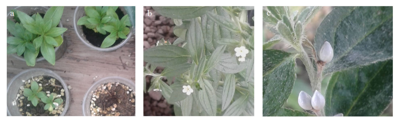
Figure 1. Cultivation of gromwell in greenhouse. a: comparison of seedling growth at peat moss (above) and the mixture of peat moss and perlite (below). b: flowering stage (70 days after planting), c: seed production stage (100 days after planting).